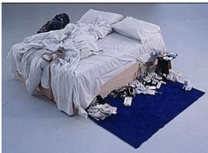
Figure 1: My Bed (Emin, 2006)