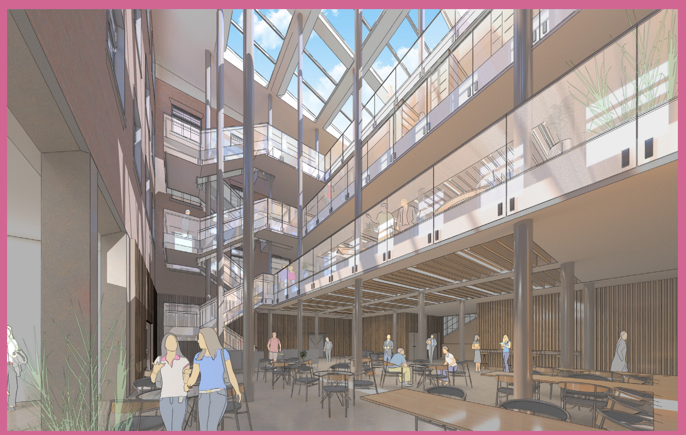
Artist's impression of the Barnsley IoT which will see the College invest circa £12 million